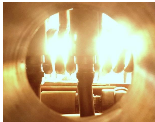
Figure 5 Fuel Element at Maximum Power

During this testing, the fuel element was above 2800 K for almost 4.5 minutes and was above 2500 K for over 8.5 minutes. The 2800 K temperature in the fuel element was achieved at an induction power level of approximately 169 kW or at just over 14% of the power available from the 1.2 MW induction heating unit. It was noticed near the end of the 4.5 minutes the fuel element was at 2800 K, that the temperature in the fuel element was starting rapidly fluctuate over a several hundred degree range and