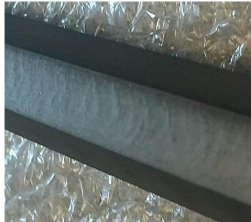
Figure 4 Testing Shows No Visible Damage

Having met the project milestones, it was decided to reinsert the fuel element into and perform additional testing. This additional testing was designed to be much more severe than that which was performed during the initial testing, and was intended to test the fuel element to the point of failure. As before, the fuel element was loaded into NTREES and subjected to an axial loading of approximately 35 pounds. The NTREES chamber was then closed and the chamber inerted with nitrogen gas and pressurized to approximately 250 psig. For this test the hydrogen flow rate within the fuel element was established at approximately 2 gm/sec. The induction heater was energized once again and power applied to the fuel element. The power and maximum temperature profiles which the fuel element encountered during this test are illustrated in Figure 4. A view of the fuel element at approximately 2800 K is illustrated in Figure 5. Note especially the increase in brightness of the fuel element in Figure 5 as compared to Figure 3 indicating the much higher fuel element temperatures achieved during this more aggressive testing sequence.