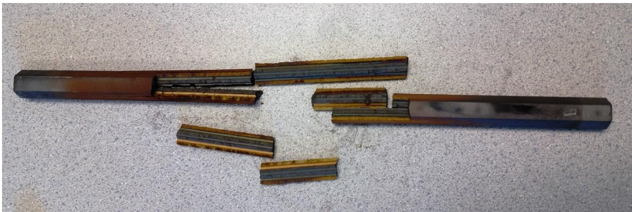
Figure 6. Failed Fuel Element from NTREES Test at 2800 K

NTREES itself apparently suffered no damage as a result of the fuel failure. The induction coil showed no degradation from the fuel failure and even the insulating sleeve which surrounded the fuel element during the test survived intact. There was a noticeable smell near the chamber after the test which was probably due to heating in the G10 feedthru flange as a result of the high current going through the conductor plates. Other than the smell, however, there did not appear to be any damage to the flange.