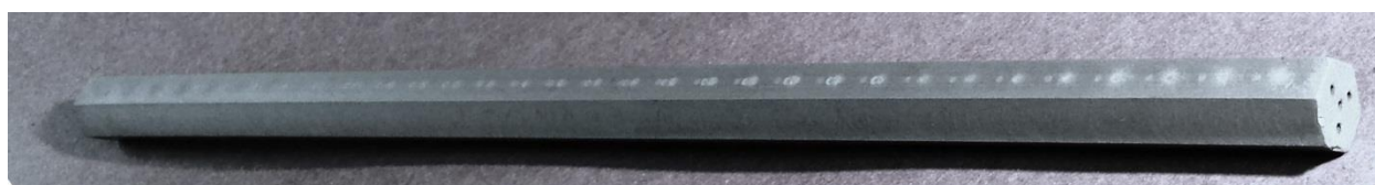
Figure 1 Oakridge Fuel Element Tested in NTREES to Meet the NCPS Milestone

To satisfy the Nuclear Cryogenic Propulsion Stage (NCPS) testing milestone, a graphite composite fuel element using a uranium simulant was received from the Oakridge National Lab and tested in the Nuclear Thermal Rocket Element Environmental Simulator (NTREES) at various operating conditions. The nominal operating conditions required to satisfy the milestone consisted of running the fuel element for a few minutes at a temperature of at least 2000 K with flowing hydrogen. This milestone test was successfully accomplished without incident. An illustration of the fuel element tested is illustrated in Figure 1.