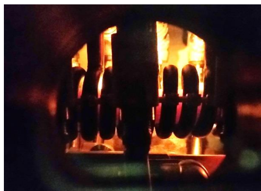
Figure 3 Fuel Element at Nominal Power